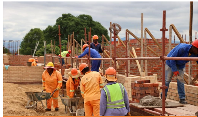
The departmental inhouse team working at the Sibasa k53 Centre