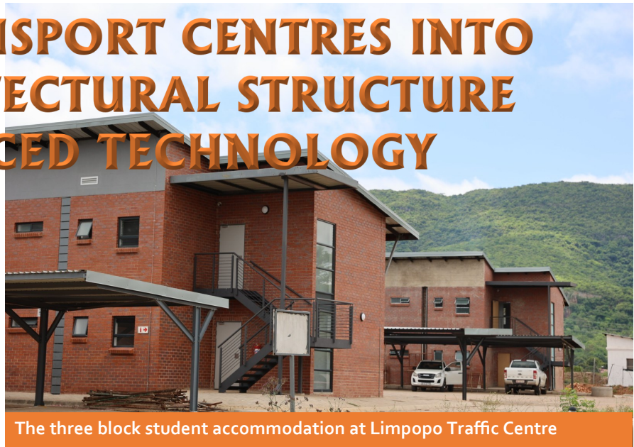
The three block student accommodation at Limpopo Traffic Centre

The department of Public Works, Roads and Infrastructure is also constructing the K53 testing centres in Seshego and Thohoyandou respectively. The Department of Public Works, Roads and Infrastructure is proud to be an implementing Agent for this project which supports the work done by the department of transport.