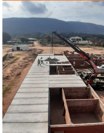
Aerial pictures of the Limpopo Traffic Centre project