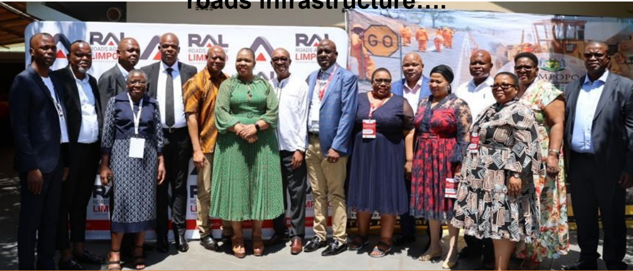
MEC Nkakareng Rakgoale, MEC Seaparo Sekoati and Deputy Minister Parks Tau flanked by RAL executive management, executive and local mayors during the signing of MOA at the Ranch Hotel outside Polokwane.