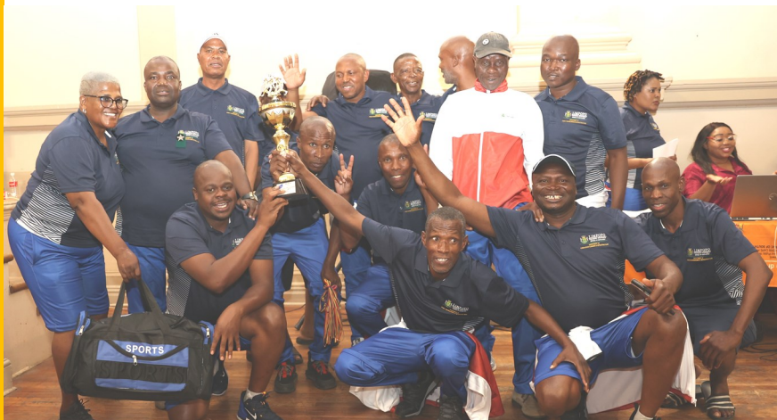
Departmental Veteran Team celebrating award winning moment during NEWSREC Award Ceremony at Kimberley, Eastern Cape

The tournament falls under the National Departments of Public Works and Infrastructure and Transport and Safety with an aim to encourage healthy lifestyle, good mental health and social interaction for the Employees. The 2023 tournament marks the 19 th year celebration since its inception.