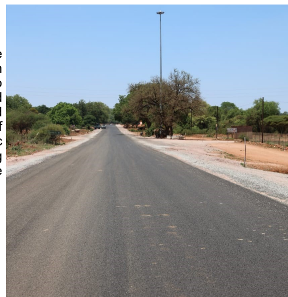
Road P277/1 Makuya to Masisi