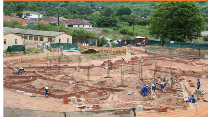
Aerial pictures of the Tshilamba Traffic Centre project