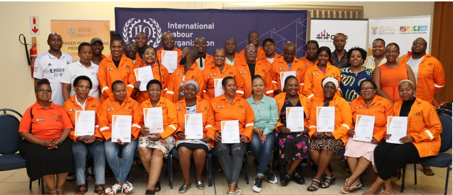
EPWP officials together with Vuk'uphile Contractor Development Programme participants during the training held at Greater Tzaneen Local Municipality.