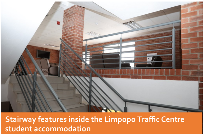
Stairway features inside the Limpopo Traffic Centre student accommodation